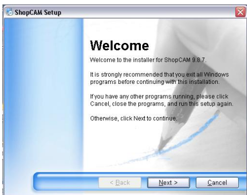
New install for Windows 7 and Vista

If you received an update and Shopcam is installed and running, there is no need to do a complete install. See the 'Simple update' below. For new installs, continue below.