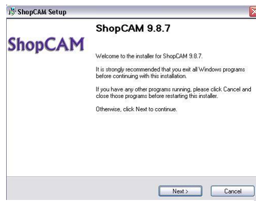
Old install for XP install

This blue screen on the left (Figure 1) is the installation program you will need. The one on the right is for older operating system. The new install will work with with XP